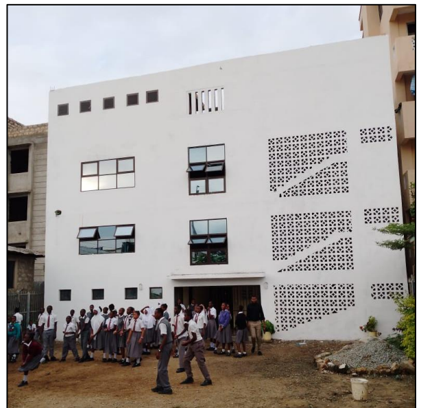
The back of the school – July 2025