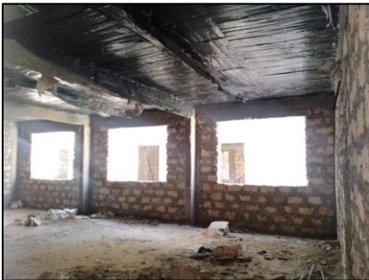
2 nd floor in Jan 2025

Our huge thanks to the many charitable trusts and individuals who helped us to achieve this development – the children will now have a place of learning for years to come – once complete, of course.