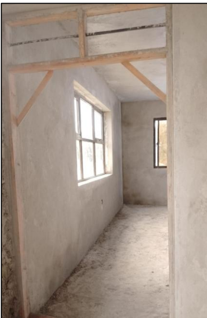
2 nd floor in late July 2025