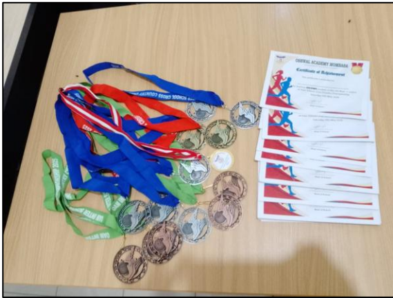
Quite a haul! Well done everyone