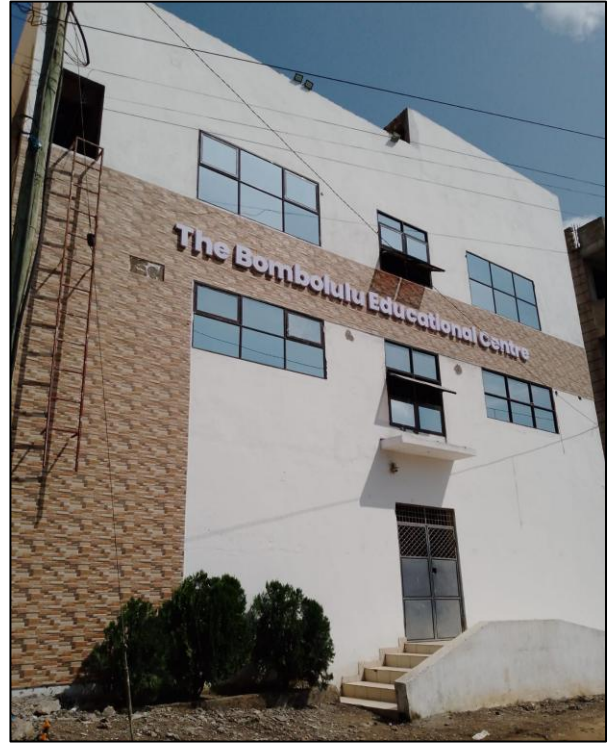
Front of school July 2025